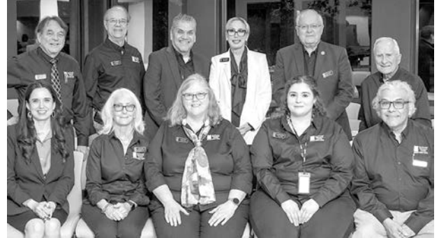
SwRCFCU's Board of Directors & Executive Leadership