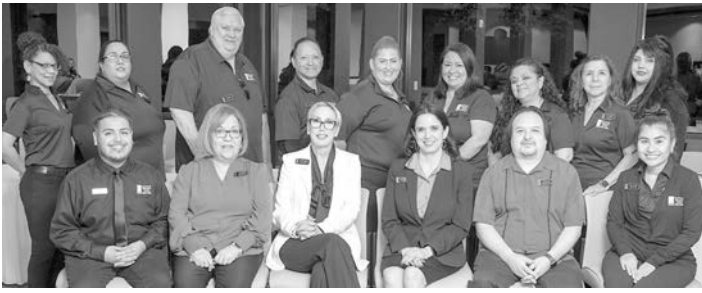
SwRCFCU's Executive Leadership & Staff